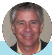
Grace and peace, Smoke

The light shines in the darkness, and the darkness has not overcome it. -John 1:5